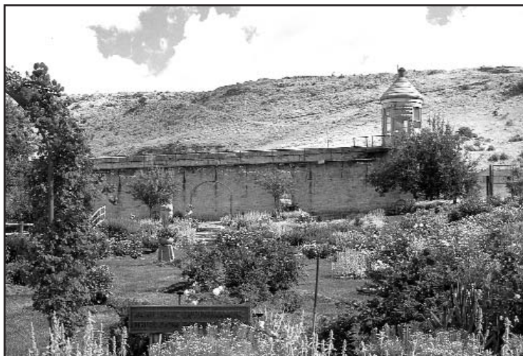
Old Pen and Idaho Botanical Gardens

The evening entertainment features Muzzie and Billy Braun, brothers that are icons of Idaho music for over 30 years, playing a blend of humor, storytelling and music.