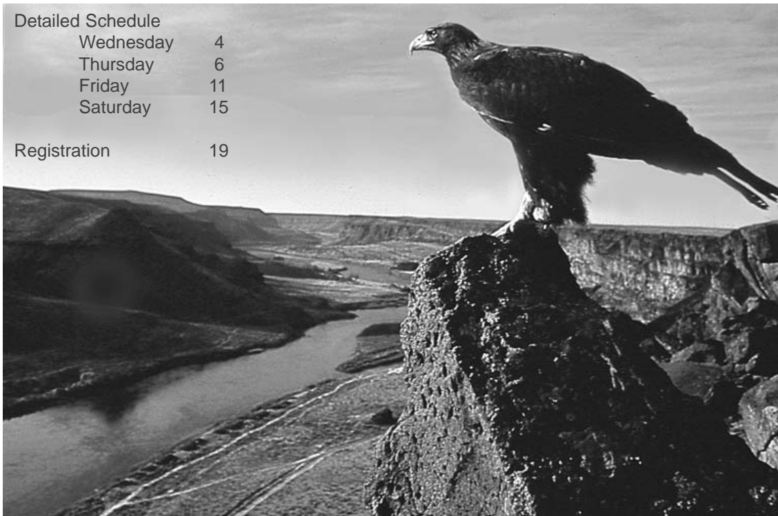
Cover and inside cover images courtesy of Boise Convention & Visitors Bureau