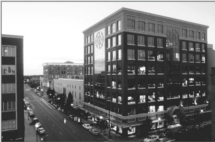
Downtown Boise

Boise is most accessible from Boise Airport (BOI) and is serviced by most major airlines including Alaska, Continental, Delta, Frontier, Horizon, Northwest, United, and Southwest Airlines. The Grove Hotel has a free shuttle service between the airport and hotel. At airport baggage claim call for the shuttle by using the Grove Hotel airport phone or phone the hotel operator directly at (208) 333-8000.