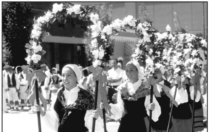
Basque community celebration

The Basque Block is located in the heart of this capitol city. An historic and cultural area that has been enhanced by a plaza-like streetscape, the area is home to the country's only Basque Museum and also features a cultural facility, historic home, historic hotel with a full handball court, pub and eatery, market and restaurant. Delegates are welcomed by the Basque community for an evening of good food, fun and entertainment provided by Txantaangorriak (Robin Red Breast), a group of local button accordionists and tambourine players, ages 5-40+, who will engage the crowd with their musical charm. After dinner, guests are treated to a performance by members of the Oinkari Basque Dancers. Formed in 1960, the dance troupe has traveled throughout the U.S. and abroad featuring traditional and choreographed dances from the Basque Country. They have also represented the State of Idaho as its ambassadors at world fairs, folk festivals, and literally hundreds of governmental and business gatherings as entertainment.