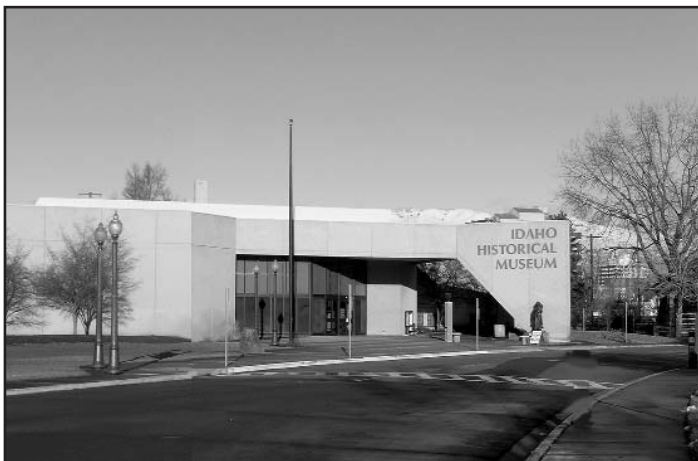
Idaho Historical Museum

Join your colleagues for the last night of the annual meeting. Tonight's progressive experience includes four of Boise's finest cultural institutions: The Discovery Center of Idaho, the Boise Art Museum, the Idaho Black History Museum, and the Idaho Historical Museum. Throughout the evening guests are treated to a "Taste of Idaho" featuring the freshest Idaho ingredients in food and beverage selections, including agricultural samplings and locally brewed beers and Idaho wines.