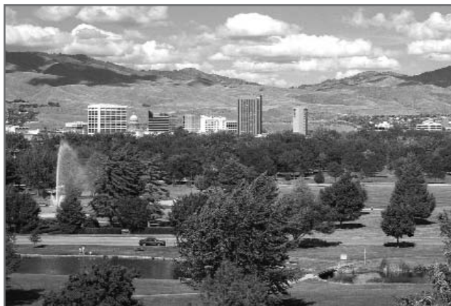
The City of Trees