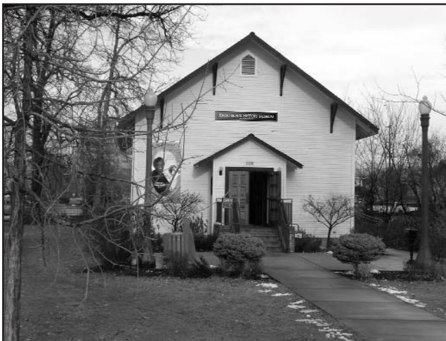
Idaho Black History Museum

At the Discovery Center of Idaho, delegates are served appetizers by resident mad scientists. The Discovery Center of Idaho is a hands-on science facility with exhibits and educational programs that offer authentic, sensory experiences making the sciences, math and technology tangible. Delegates this evening are encouraged to try out a variety of scientific tasks.