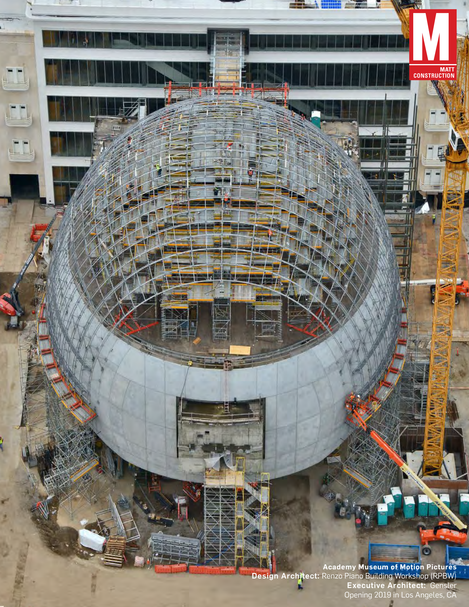
Academy Museum of Motion Pictures Design Architect: Renzo Piano Building Workshop (RPBW) Executive Architect: Gensler Opening 2019 in Los Angeles, CA